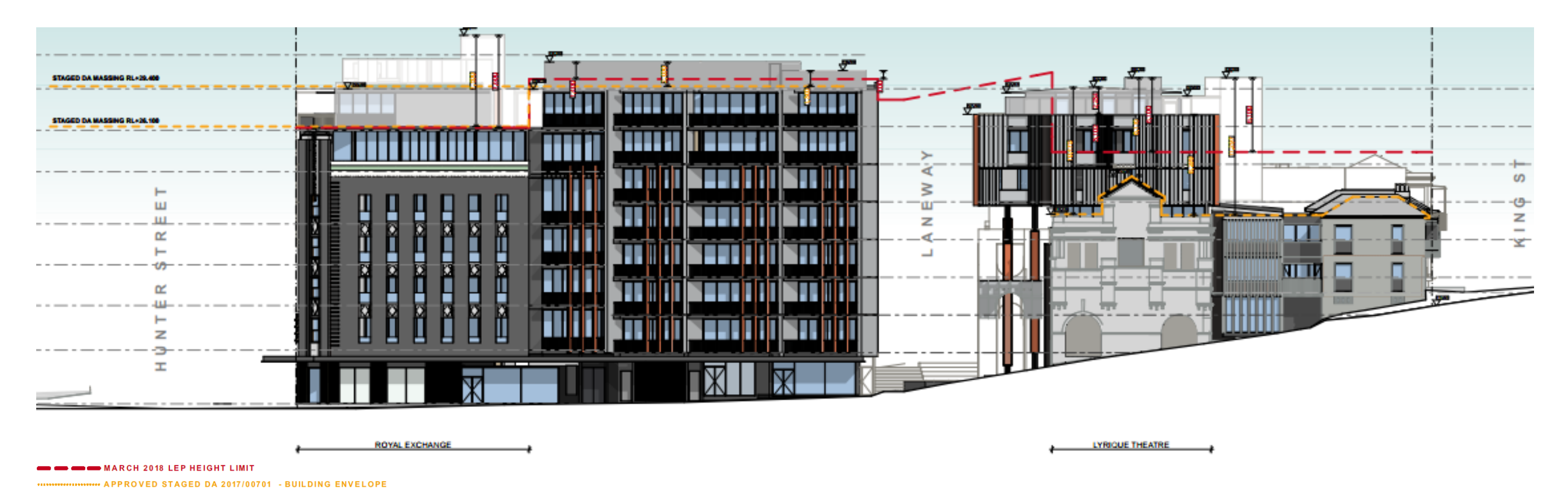
Figure 2: Variations to Height of Building Standard – Wolfe Street Elevation