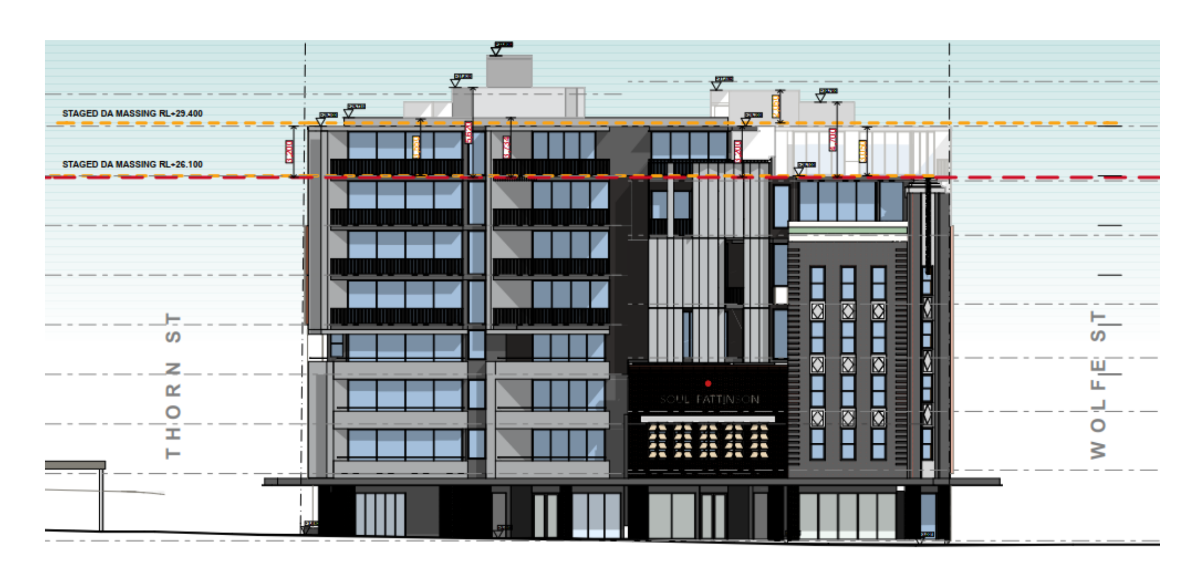
Figure 3: Variations to Height of Building Standard – Hunter Street Elevation